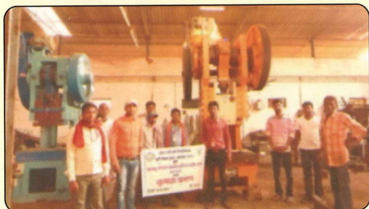
Exposure visit to College of Agricultural Engineering, IGKV Raipur.