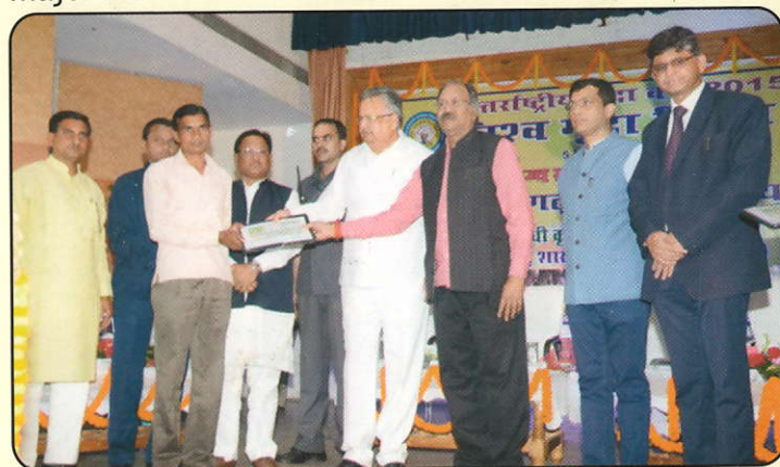
Hon,ble CMs of M.P. Sh Shivraj Singh chauhan and Dr Raman Singh of CG at World Soil Health Day Programme

The programme was very important testimonied by the presence of Hon'ble Chief Minister, CG Dr. Raman Singh, at Raipur, Hon'ble Chief Minister, MP Sh. Shivraj Singh Chouhan at Bhopal, Hon'ble Minister of State for Mines, Steel, Labour and Employment Gol, New Delhi, Sh. Vishnudev Sai, Seven Ministers from State Governments of Madhya Pradesh, Chhattisgarh and Odisha, 27 Hon'ble Member of Parliament, 60 MLAs, 71 Zila Panchayat Chairman and other dignitaries. Exhibition was also organized by 99 KVKs on this