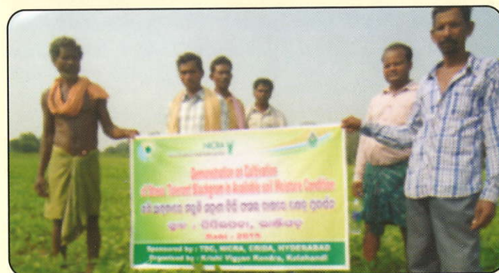
Cultivation of stress tolerant black gram