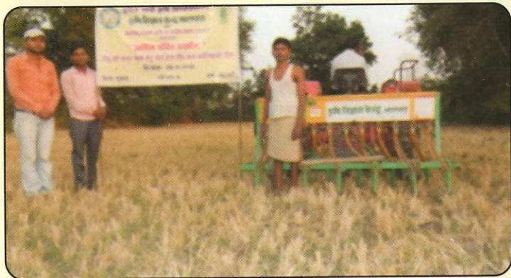
Zero till sowing of wheat