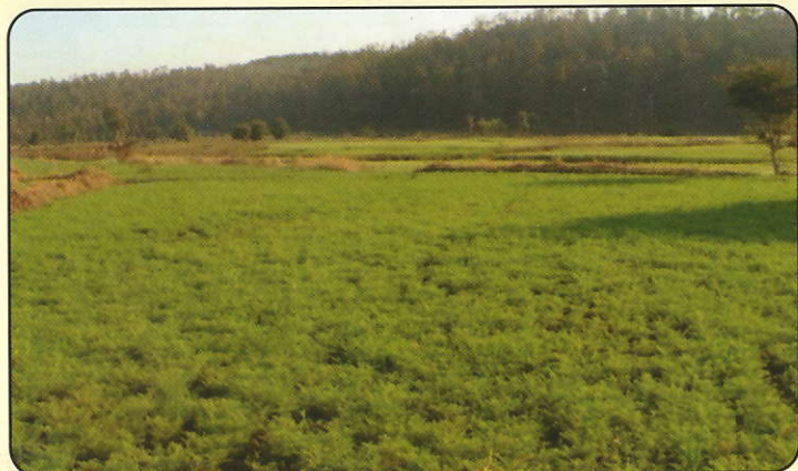
FLD on Chickpea : Variety JG 63

the M.P. and Chhattisgarh. 1100 demonstrations were conducted in different pulse crops in an area of 440 ha with Chickpea (JG-11, JG-16, JG-130, JG-63), Field pea (Shubhra, Vikas, Paras, Prakash) Lentil (JL-3).