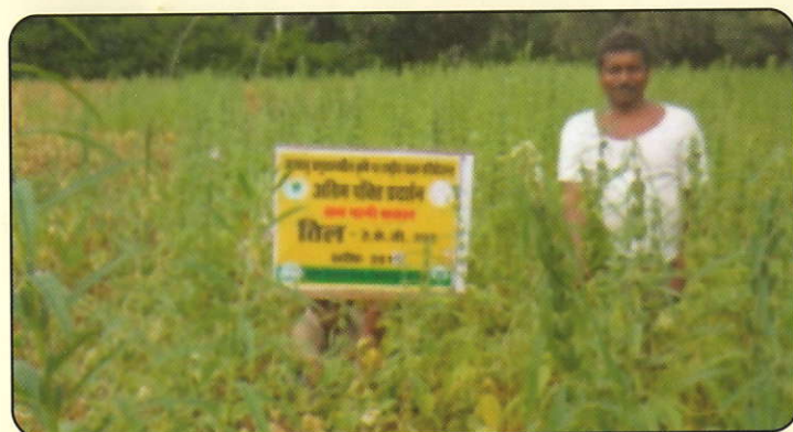
Demonstration of stress tolerant sesamum Cv- Prachi