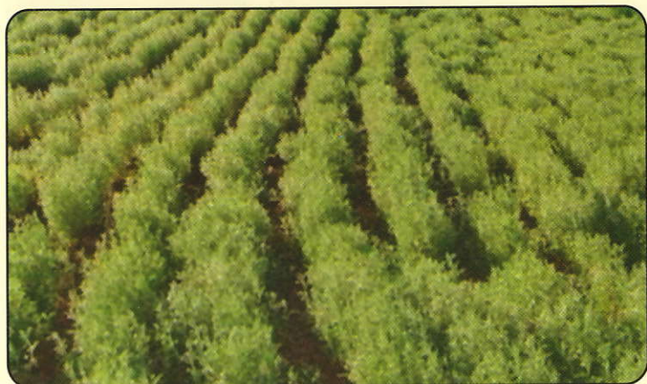
FLD Crop of Lentil variety JL-3