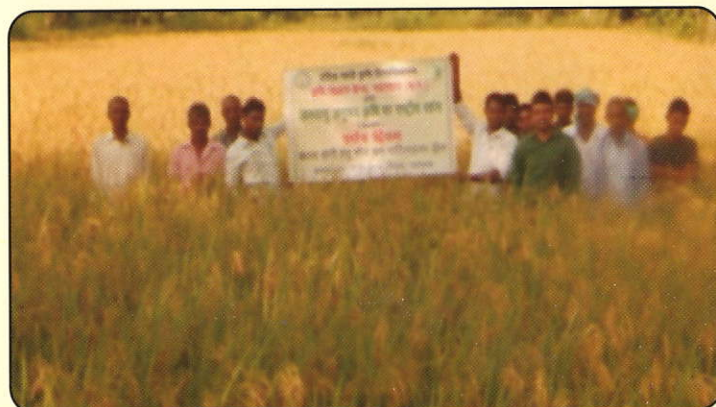
Field Day on DSR with seed cum fertilizer drill.